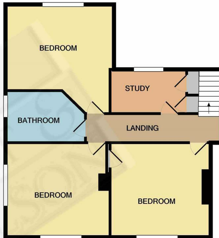
1ST FLOOR APPROX. FLOOR AREA 574 SQ.FT. (53.4 SQ.M.)

TOTAL APPROX. FLOOR AREA 1205 SQ.FT. (111.9 SQ.M.)