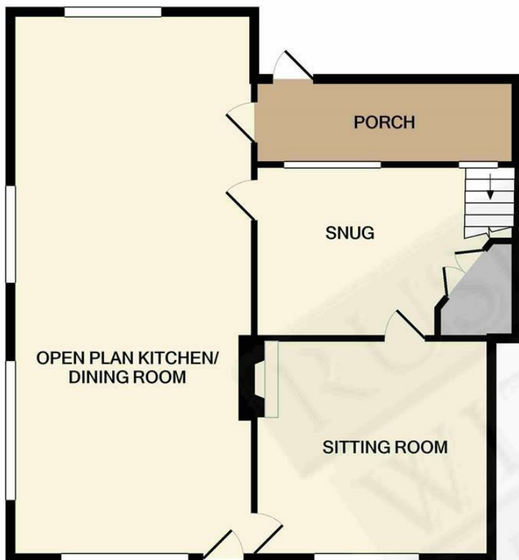
GROUND FLOOR APPROX. FLOOR AREA 630 SQ.FT. (58.6 SQ.M.)